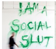
Berlin-Paris: allied art Jan 12, 2011