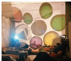
Otto in the sky Jul 15, 2014